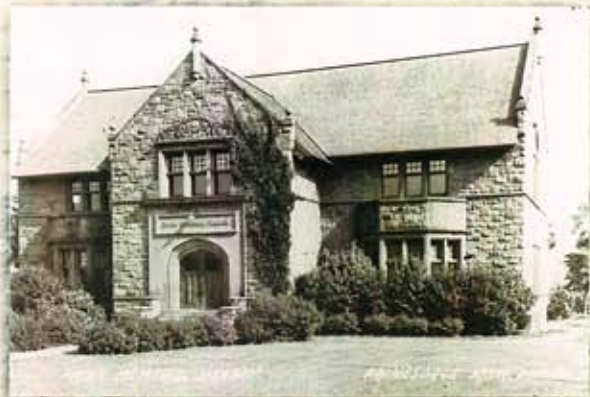
ACHIEVEMENT- SSPHRC interpretive display

The Sarah Sargent Paine Historical Research Center (SSPHRC) exists to be a hub for the development and integration of community based projects, programs, resources and activities related to the history of the people, communities and organizations of Adams Township. The SSPHRC is involved in fund-raising activities to enhance the ATSD Foundation, Inc.