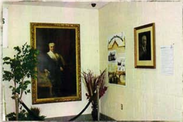
The SSPHRC provided the funds to create a temporary interpretive display of the community's history in the Jeffers High School entrance.